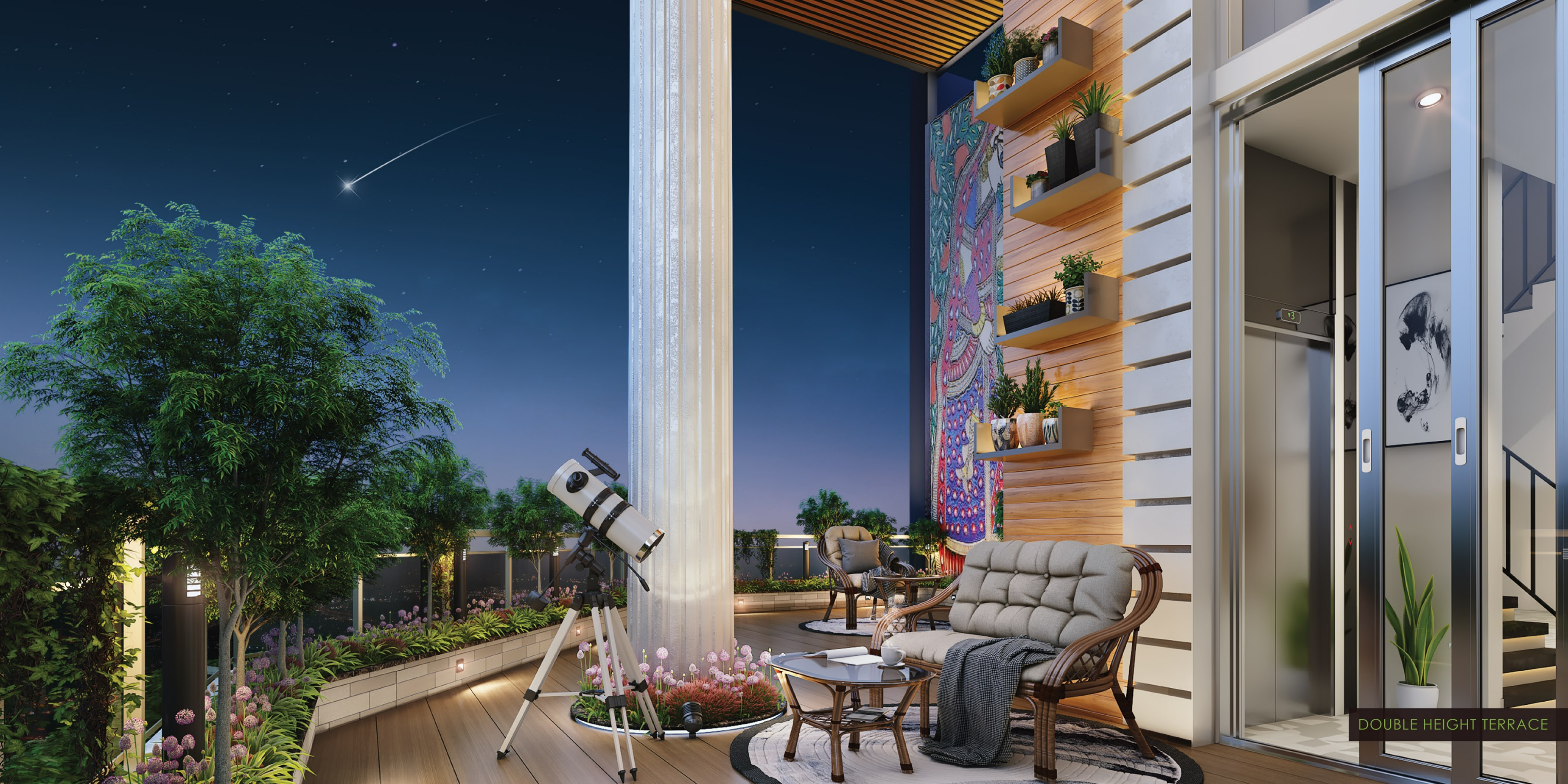
DOUBLE HEIGHT TERRACE